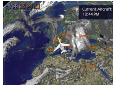
From world-wide satellite view to your current conditions or five-day forecast, JetMap III provides a whole new look at your weather situation.