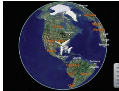
From space shuttle altitudes to street level maps - and everything in between - JetMap III offers magnificent map views for the entire globe.

The Satcom link provides a very consistent, low-cost, worldwide connection for the periodic upload of the latest news, sports, business and weather content. Honeywell's Flight Support Services, powered-by Satcom Direct, provides simplified account management and the best customer support representatives in the industry.