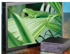
HD Monitor and Blu-ray Disc Player

architecture to add the HD experience to any existing C-Series cabin.