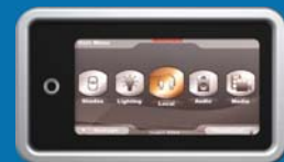
Select 200 PCU

You control the functionality of all the cabin components (e.g., entertainment, water system, temperature, speakers, shades, etc) from the comfort of your seat using customizable personal control devices with easy-to-read touch screen navigation.