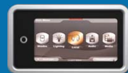
Select 200 PCU

You control the functionality of all the cabin components (e.g., entertainment, water system, temperature, speakers, shades, etc) from the comfort of your seat using customizable personal control devices with easy-to-read touchscreen navigation.