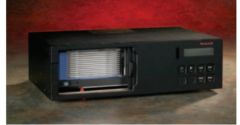
Multiple-Disc CD Player