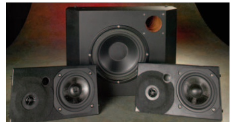
Speakers and Subwoofer