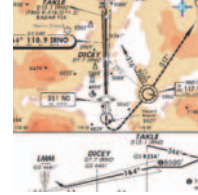
Charts and Maps