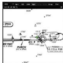
Integrated electronic charts